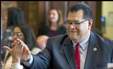
Former Illinois state Senator Sandoval pleads guilty To bribery and tax fraud; Southern Illinoisan, January 28, 2020