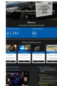
Home page with running totals for dispatched calls for service, response to resistance incidents and employee complaints

The department intends to continue expanding the data available in dashboards to ensure the Elgin community has access to information that will strengthen the bond of trust between the police department and the community.